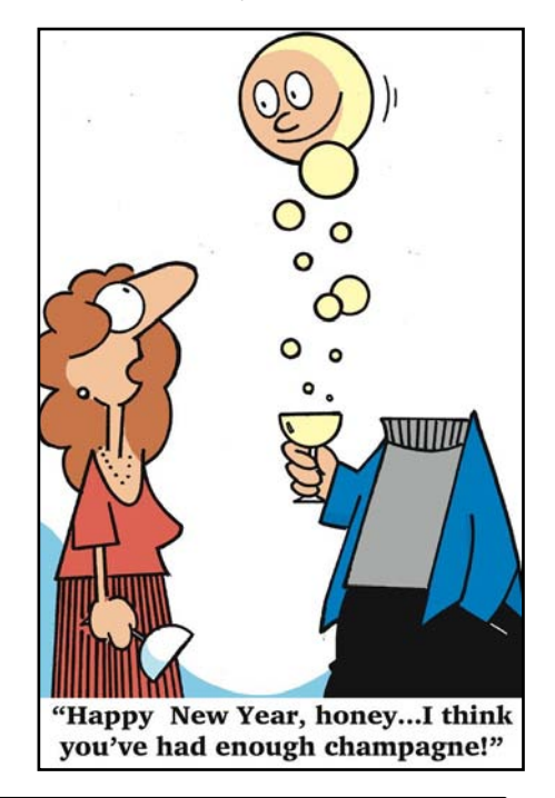
31 December, 2022 / 01 January, 2023 • Page 2