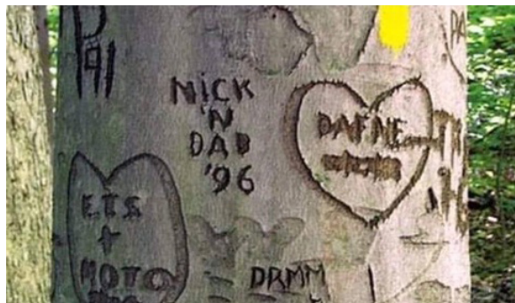
When I see lovers' names carved on trees, I think it's strange how many people bring knives on a date.