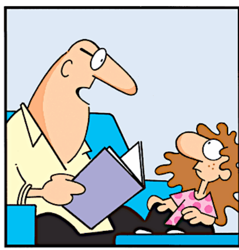
"First Goldilocks ate Papa Bear's porridge, then she ate Mama Bear's porridge, then she ate Baby Bear's porridge...and her cholesterol dropped 23 points!"

The Church's new Liturgical Year (Sunday cycle B, weekday cycle 2) begins next weekend, with the First Sunday of Advent.