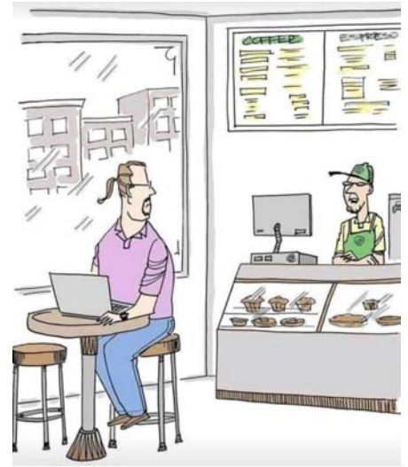
"The WiFi password is: 'buysomethingorleave'"