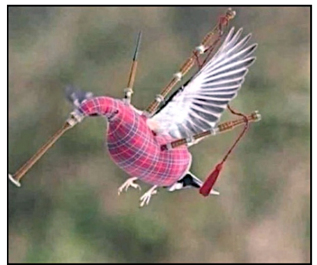
Above: A photograph of the incredibly rare Scottish Hummingbird