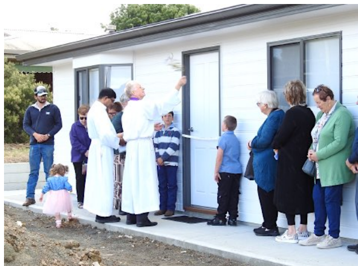
Blessing of the new Parish House