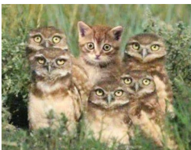
When you lie on your resumé, but still get the job.