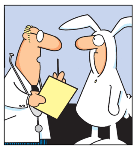
"If hopping burns more calories than walking and it helps you eat more salad, then OK, I approve the Bunny Suit Diet"