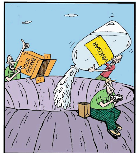
Volcanologist practical jokes