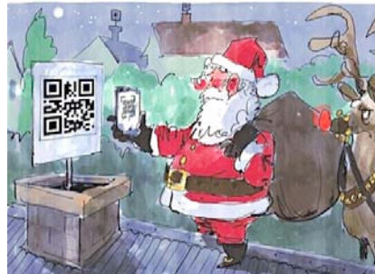
Did you miss out at Christmas?

While they may look simple, QR codes are capable of storing lots of data. But no matter how much they contain, when scanned, the QR code will allow the user to access information instantly – hence why it's called a Quick Response code.