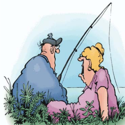
“I can’t see any sense in this! We passed about ten fish markets on the way here.”