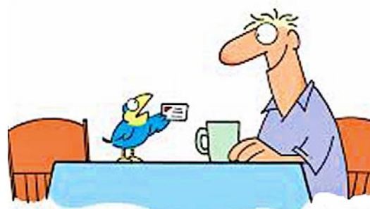
"I'm the Bluebird Of Fleeting Happiness. You've been pre-approved for another credit card!"